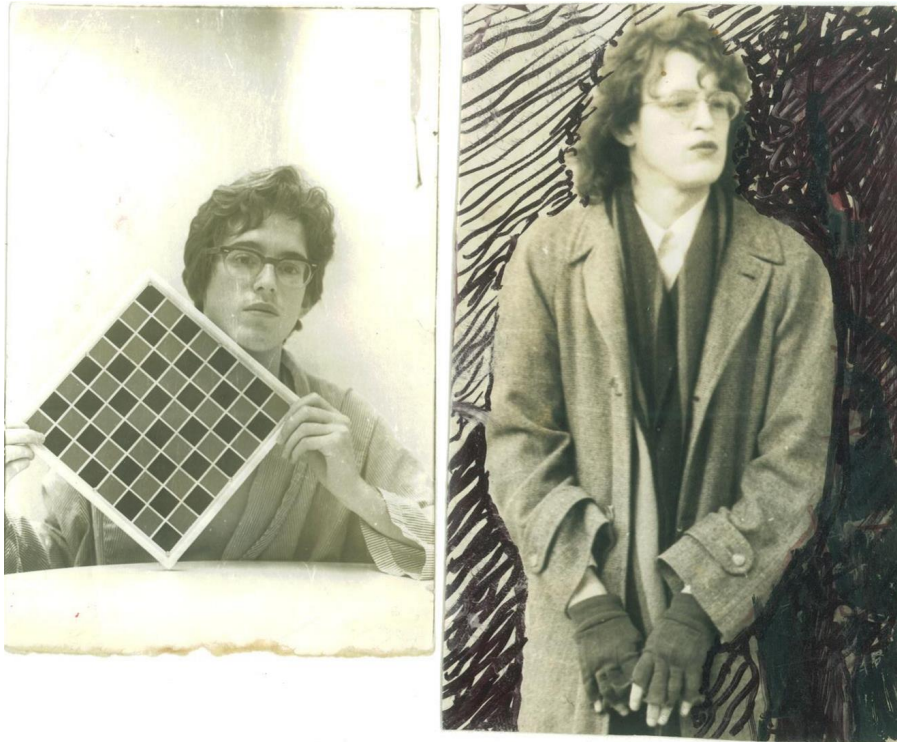
Mental Patient/ Alien City composer

After emerging from a mental hospital in 1978 we began recording a huge song cycle I wrote called Alien City. There were four parts to it with each part about 30 minutes long. It was filled with angst, cynicism, mysticism and social surrealism. The songs became very science fiction oriented especially in parts 3 and 4, where a young man discovers that the sun is not hot, but cool, and he abandons the earth to live inside of it, charging himself up with spiritual solar energy, while killer fogs turn people into spiritual amnesiacs. A boy takes off his clothes and runs with a pack of dogs, against the wishes of the city fathers. A young man finds the courage to leave the underground fallout shelters and venture to the top of the world, despite what all the doctors tell him. People everywhere are sleepwalking their lives away. Cultural heroes are mummified and they charge you to go inside and see their remains.